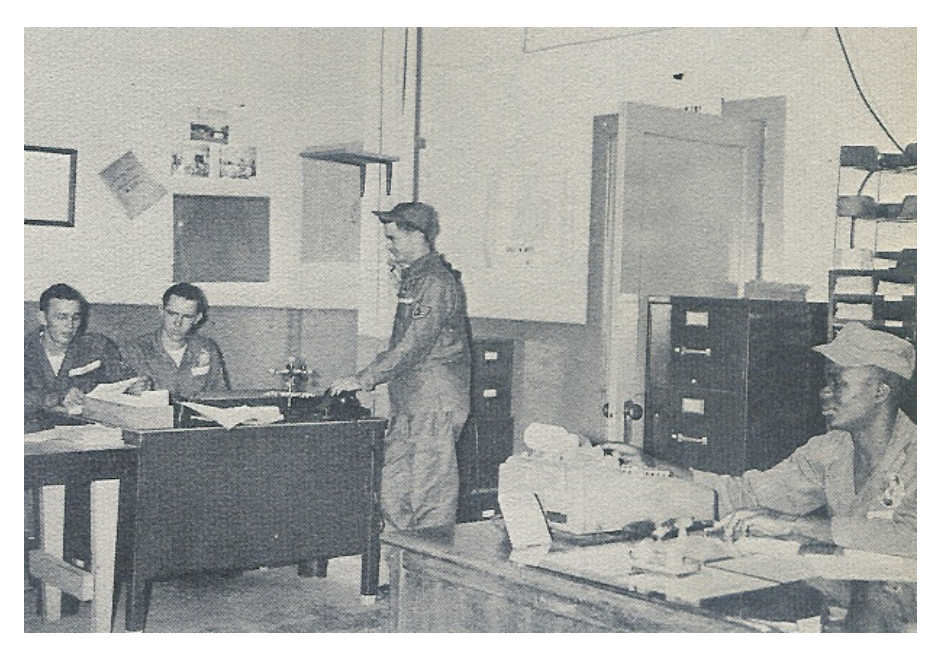
Office personnel of drivers school and accident investigation section, 366 MVS, England AFB, LA, 1955