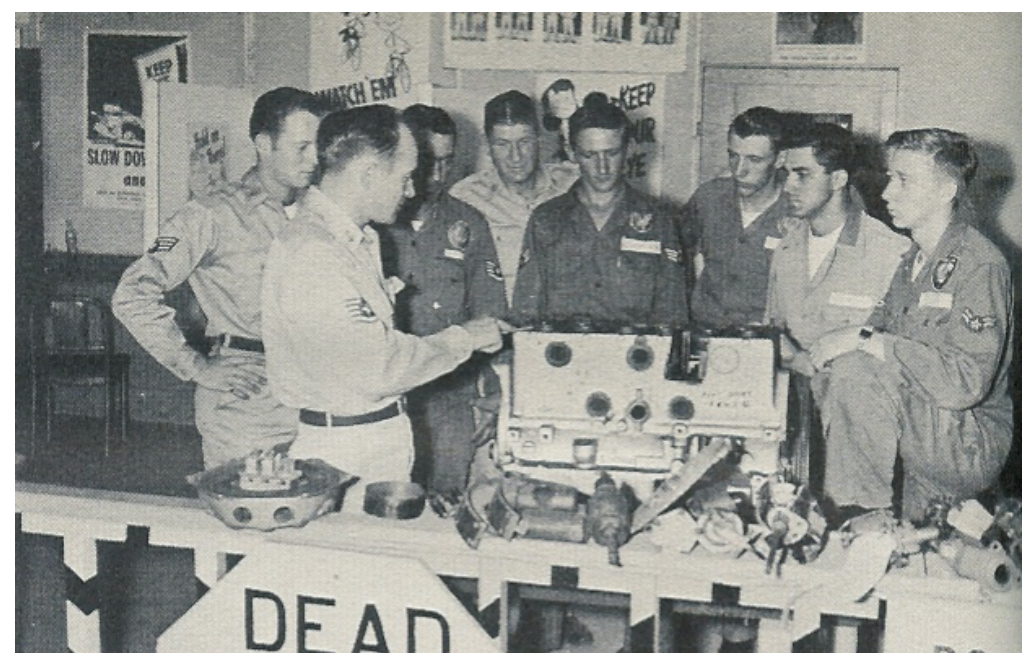
Drivers are instructed on the 4 cylinder engine, England AFB, LA, 1955.