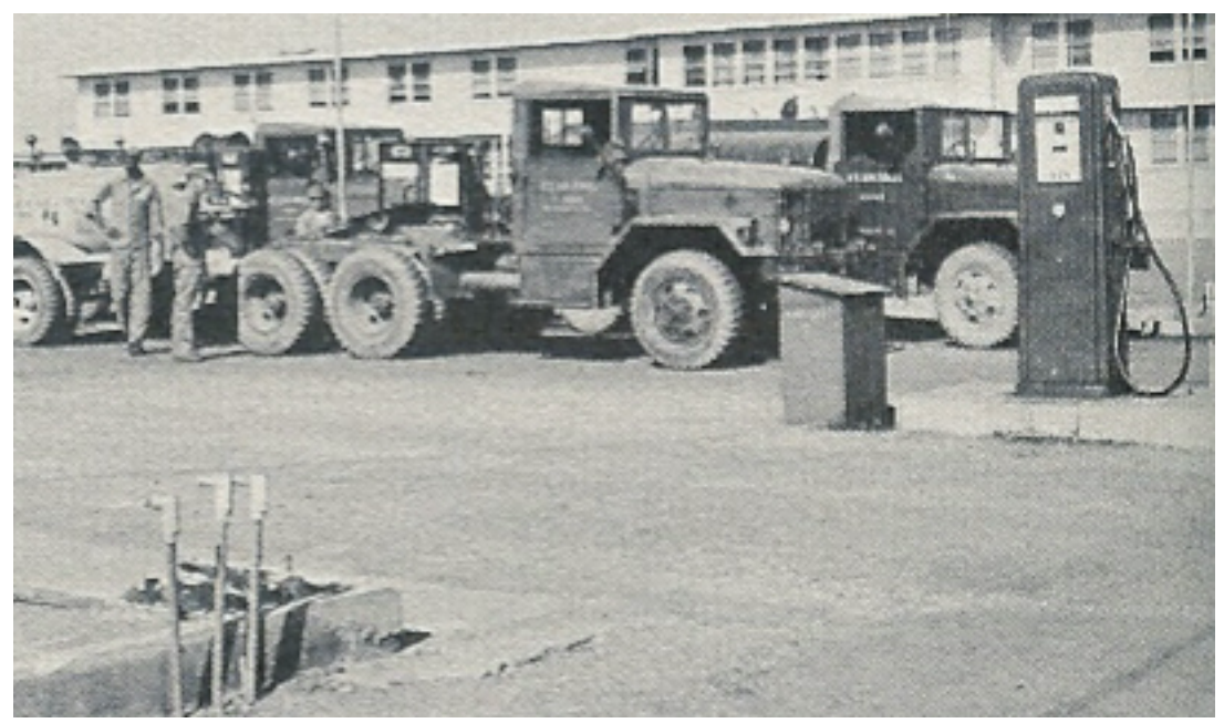
Vehicles gas up at the motor pool filing station, England AFB, LA, 1955.